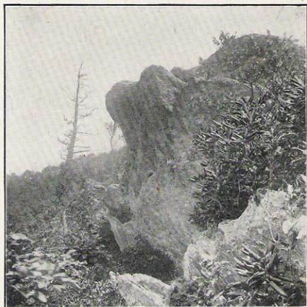
The Celebrated "Blowing Rock" at Blowing Rock, N. C., Reached Via Linville River Railway

If you are looking for an ideal location for a permanent or for a summer home, among the congenial and intelligent people, in a country of surpassing beauty and attractiveness, where health and comfort are equal to the best, you would do well to investigate the attractions of the many progressive communities along and adjacent to the lines of the East Tennessee & Western North Carolina Railroad and the Linville River Railway.