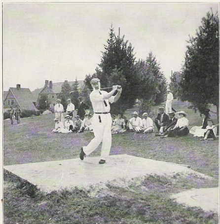
On the Links, Linville, N. C.

which are open to all visitors on the payment of nominal fees. The fourteen-hole course is considered by experts to be one of the sportiest and best kept in the Southern Appalachian region, and the tournaments held here during the summer season attract devotees of the game from far and near.