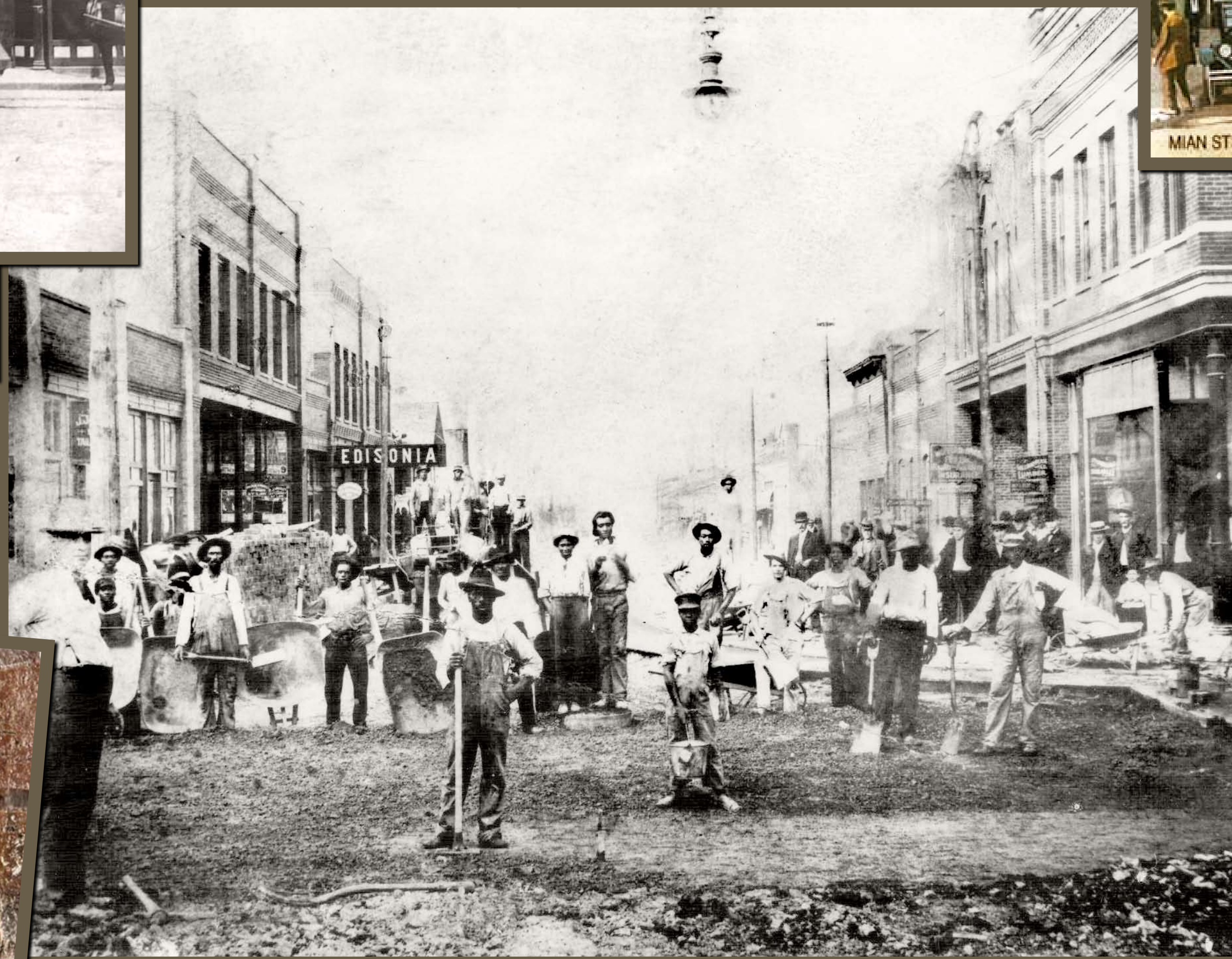
Workmen prepare the roadway for the installation of Pebbles block bricks at the intersection of Main and Roan.