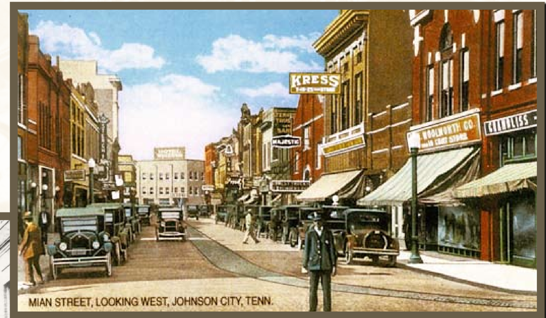
MIAN STREET, LOOKING WEST, JOHNSON CITY, TENN.