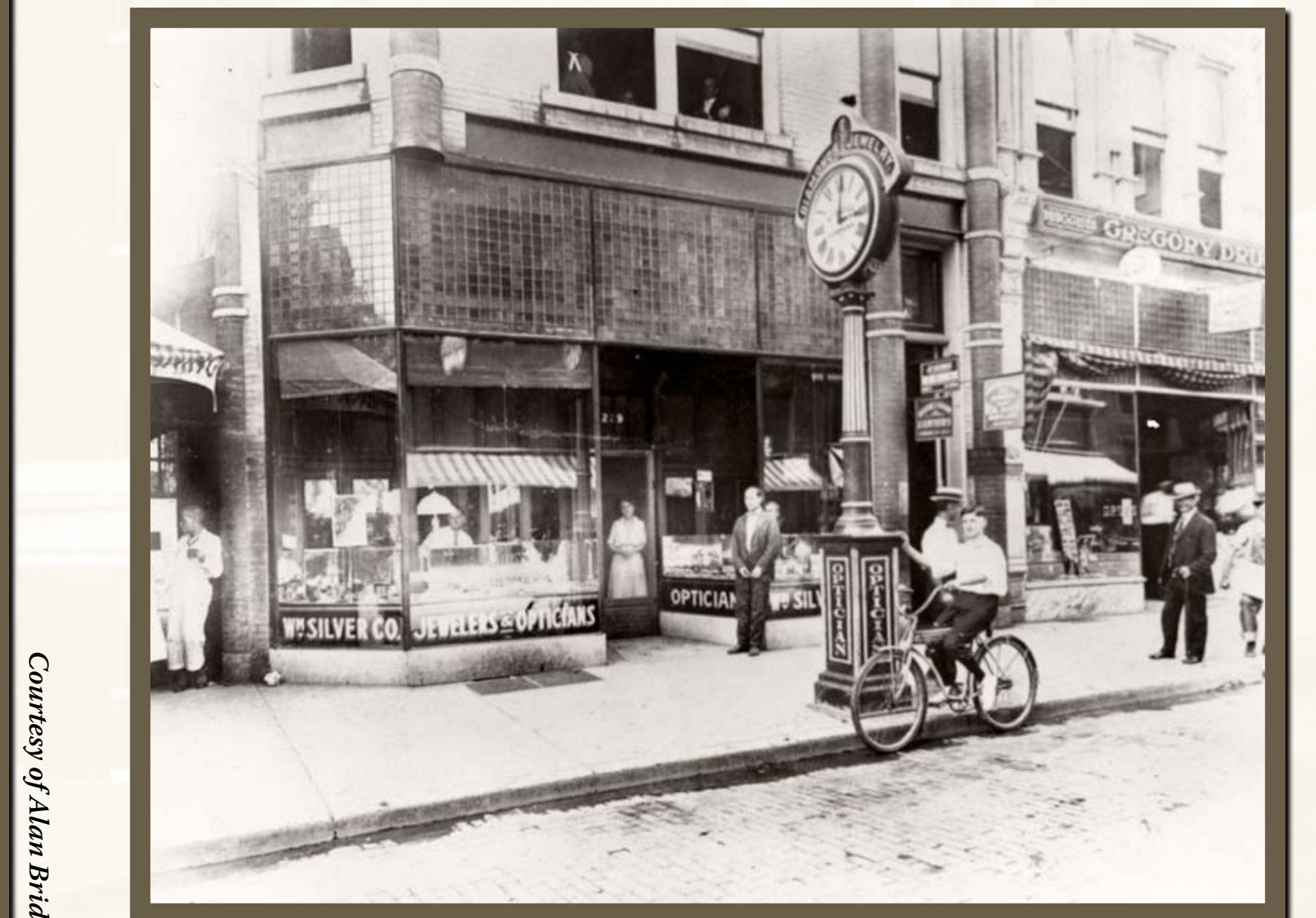
Life on Main Street in 1922.