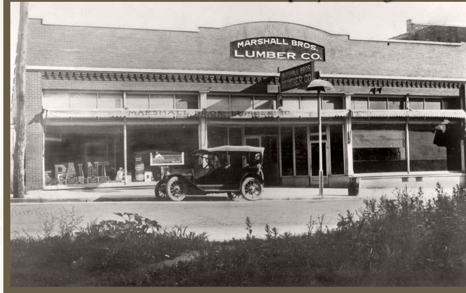
The Marshall Brothers Lumber Company building, ca. 1930.